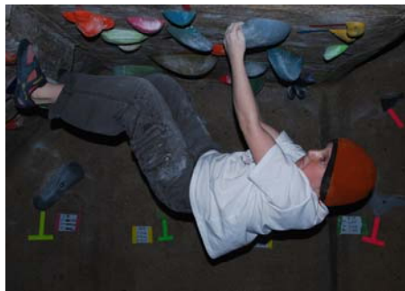
One of the campers at Upper Limits St. Louis shows his peers how to negotiate a tough bouldering problem.

each clinic will include four days of activities and a clinic t-shirt. Clinic sessions run in June, July, and August and do fill up quickly, so sign up today!